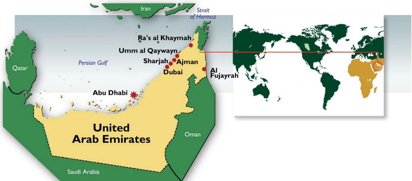
This map is a generalized illustration only and is not intended to be used for reference purposes. The representation of political boundaries does not necessarily reflect the position of the Government of Alberta on international issues of recognition, sovereignty or jurisdiction.

Government of Alberta ■ International and Intergovernmental Relations