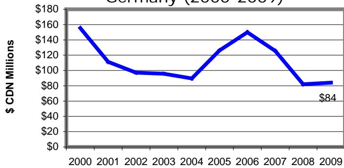
Alberta's Merchandise Exports to Germany (2005 - 2009 Average)